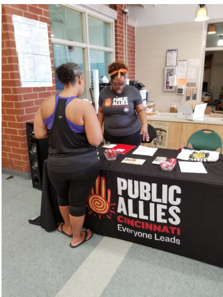
Public Allies Cincinnati is a member of the AmeriCorps national service network.