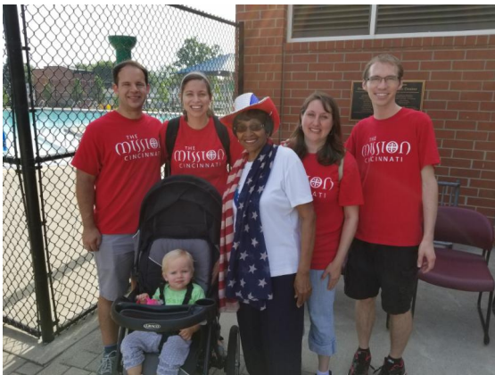
The Mission Cincinnati http://www.missioncincinnati.org/about/#who-we-are