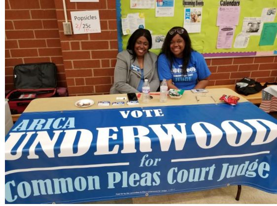
Arica Underwood for Judge https://www.aricaunderwoodforjudge.com/about/