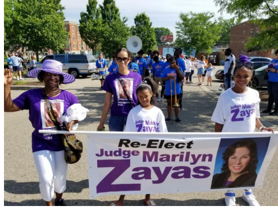
Re-elect Judge Zayas First District Court of Appeals https://www.facebook.com/Vote4JudgeZ/