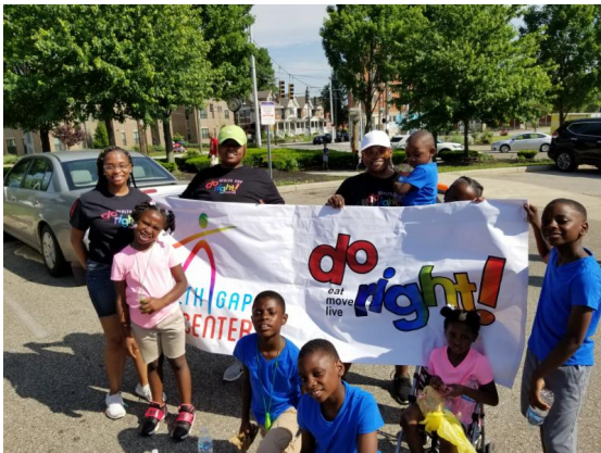
Closing Health Gap, Do Right Babies Program http://closingthehealthgap.org/