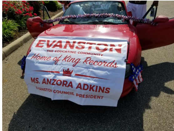
The former King Records headquarters, at 1540 Brewster Ave., is still standing. A historical marker was placed by the Rock and Roll Hall of Fame in 2008