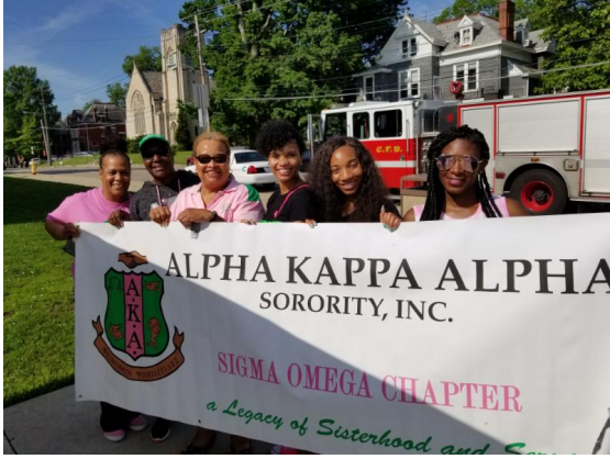
Alpha Kappa Alpha Sorority, Inc., Sigma Omega Chapter http://akasigmaomega.org/