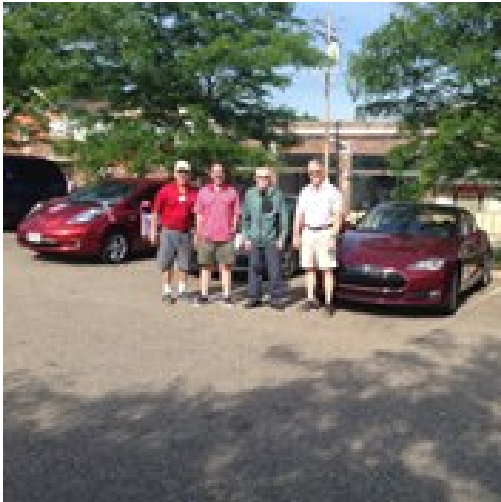
Cincinnati Electric Car Club https://www.facebook.com/cincinnatielectriccarclub/ @cincinnatielectriccarclub