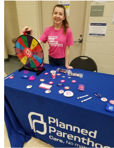
Planned Parenthood Southwest Ohio Region