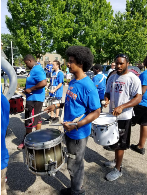
Cincinnati Music & Arts Program Marching Band